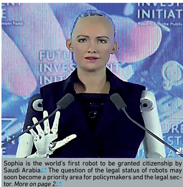
Sophia is the world's first robot to be granted citizenship by Saudi Arabia. ↗ The question of the legal status of robots may soon become a priority area for policymakers and the legal sector. More on page 2. ↗